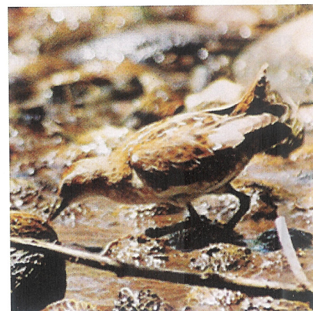
Figures 1–2. Little Crane / Marouette poussin Porzana parva , Cousin Island, Seychelles, December 2004