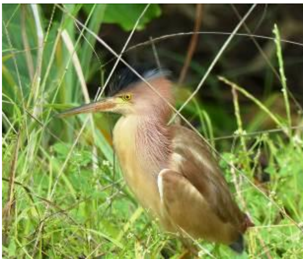
Yellow Bittern (Pep Nogués)

This is the 5 th record for Seychelles and the first for the outer islands.