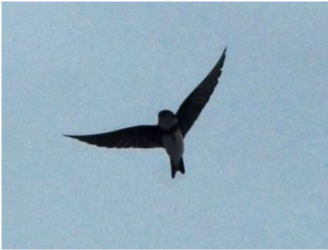
Sand Martin