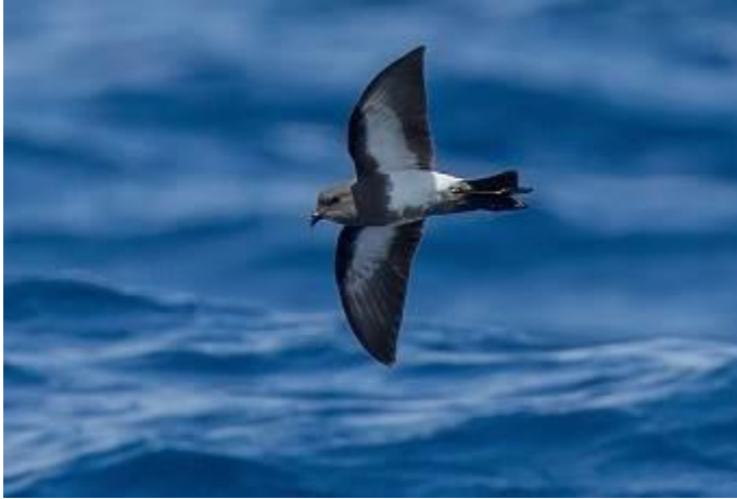
Black-belled Storm-petrel (Hadoram Shirihai)

One at approximately 4°27'S 56°46'E on 28 July 2014 (Emma Juxon).