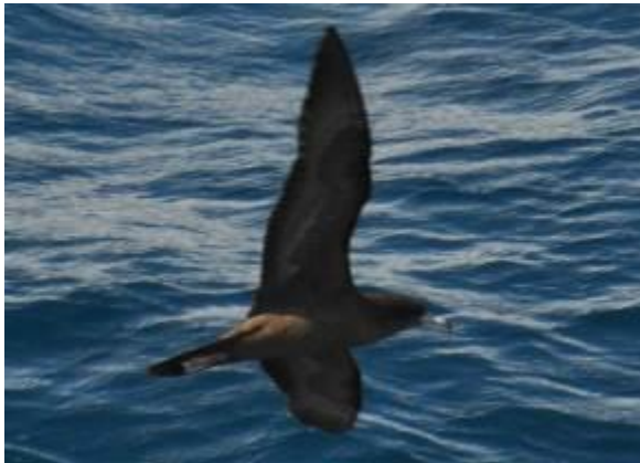
Jouanin's Petrel

This is the 13 th record for Seychelles.