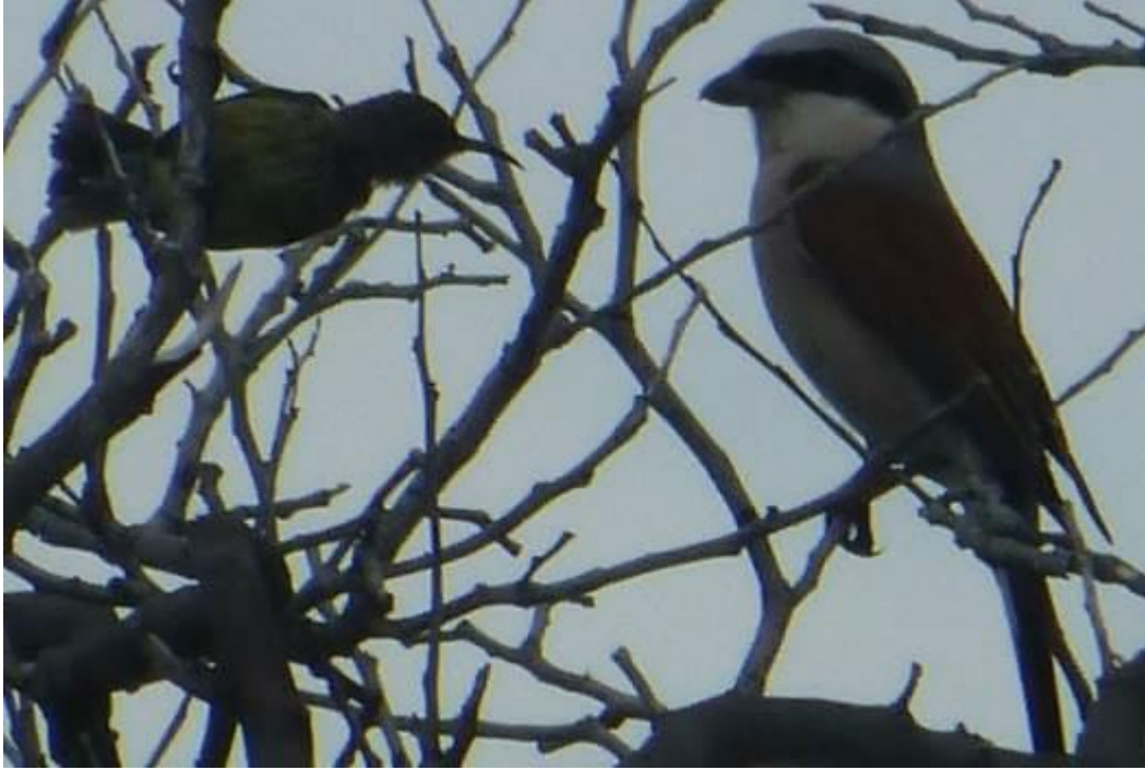
Resident sunbird meets visiting shrike