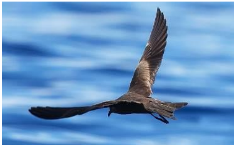
Matsudaira's Storm-petrel (Hadoram Shirihai)

One c. 15 miles north of Denis on 25 November 2014. Five at 03° 37'S 055.36'E on 25 November 2014. Four at 03° 29'S 055° 47'E on 25 November 2014. One at 03° 35'S 055° 43'E on 25 November 2014. Three at 03° 47'S 056° 11'E on 26 November 2014 (H Shirihai, AP Skerrett).