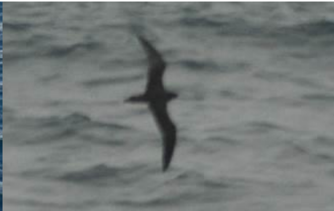
Flesh-footed Shearwater (Emma Juxon)