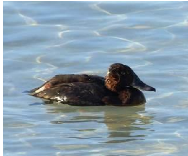
Ferruginous Duck (Pep Nogués)