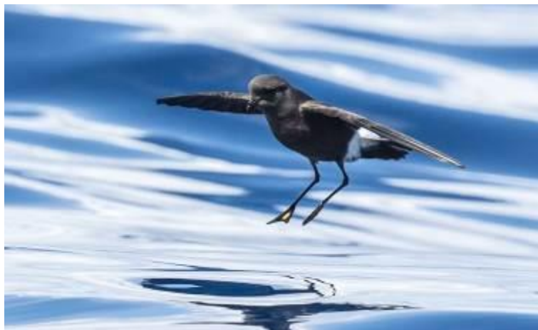
Wilson's Storm Petrel (Hadoram Shirihai)

One c. 5 miles north of Denis on 25 November 2014. Three at 03° 37'S 055.36'E on 25 November 2014. Three at 03° 29'S 055° 47'E on 25 November 2014. Three at 03° 35'S 055° 43'E on 25 November 2014. About 15 (maximum seen at any one location along slick seven) at 03° 47'S 056° 11'E on 26 November 2014 (H Shirihai, AP Skerrett).