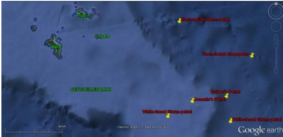
Location of pelagic sightings of Emma Juxon