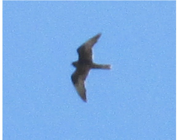
Eleonora's Falcon at Denis (left, RM Mason) and at Assumption (above, P Bauville).

One adult dark morph over the airstrip at Assumption 13 November 2013 (P Bauville).