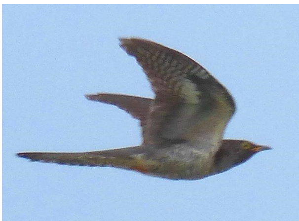
Common Cuckoo at Alphonse

These are the 19 th and 20 th records for Seychelles.