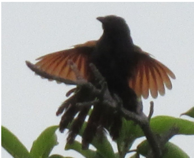
Madagascar Coucal at Assumption (J Moumou)

One adult at the Settlement area at Assumption 29 January 2013 and at scattered locations on sporadic dates thereafter to at least 12 November 2013 (J Moumou, P Bauville, L Koehler)