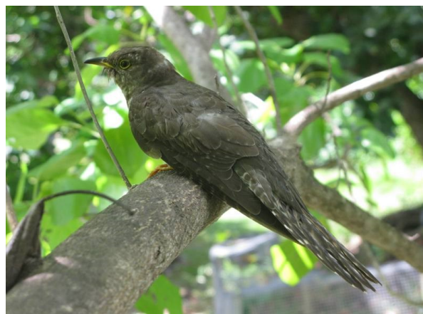
Lesser Cuckoo at North Island (Greg Wepener)