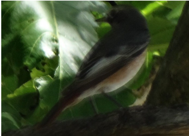
Common Redstart at Aride

This is the 29 th record for Seychelles.