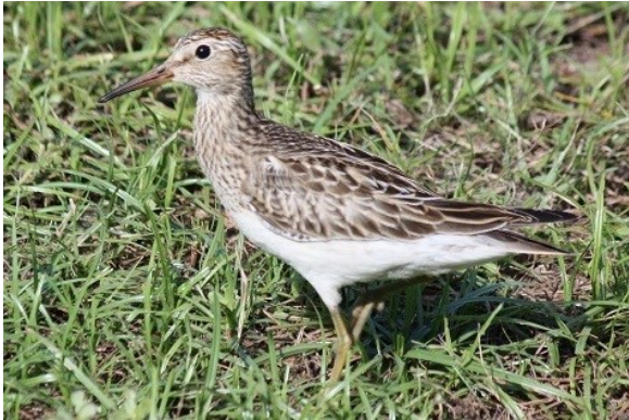
Pectoral Sandpiper at Cousine

This is the 35 th record for Seychelles.