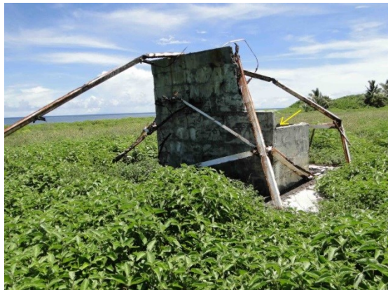
Location of Common Moorhen sighting at African Banks (Jeanne Mortimer)

One adult at Etoile on 26 November 2013 (G Rocamora).