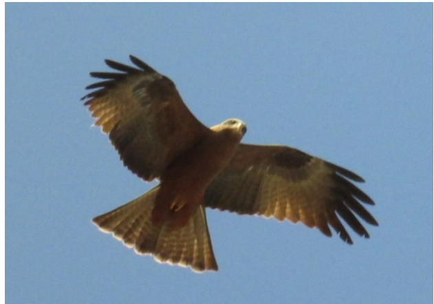
Yellow-billed Kite at Assumption (L Koehler)