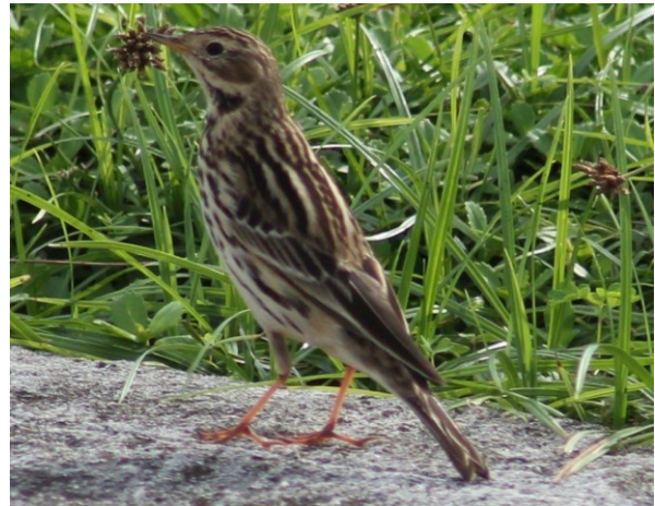
Red-throated Pipit at Remire (Gérard Rocamora)