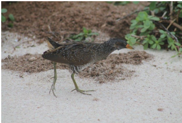
Spotted Crane at Etoile

These are the 38 th and 39 th records for Seychelles, including the first record for Denis.