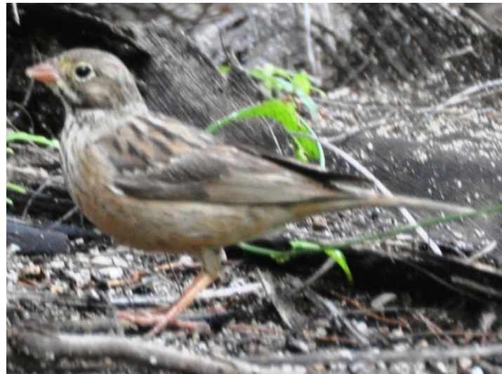
Ortolan Bunting at Alphonse