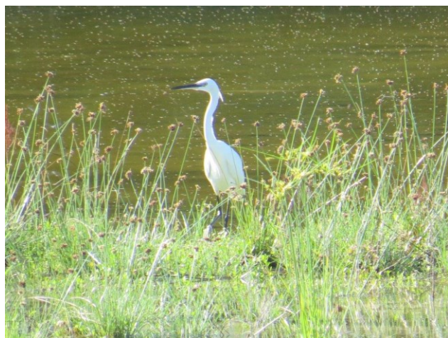
Little Egret at Ile Perseverance

This is the 31 st record for Seychelles.