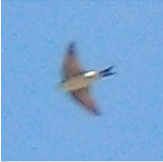
Common House Martin