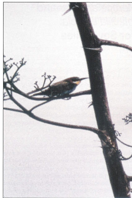
European Bee-eater Merops apiaster , Aldabra, Seychelles, 25 November 1998

A large graceful bee-eater with long wings and pointed central tail feathers. Chestnut cap and mantle, and yellow lower back and rump. Throat yellow, outlined with black and rest of underparts turquoise. In flight, the underwing was observed to be greyish rufous. Upperwing green on outer half, rufous on inner half. The individual appeared to be in fine condition,