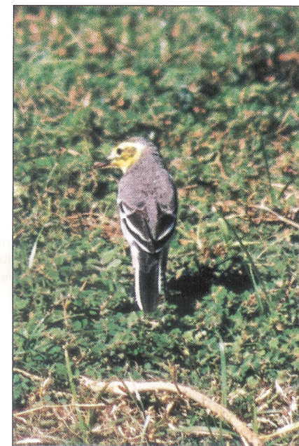
Citrine Wagtail Motacilla citreola, Frégate, Seychelles, 16 April 1999