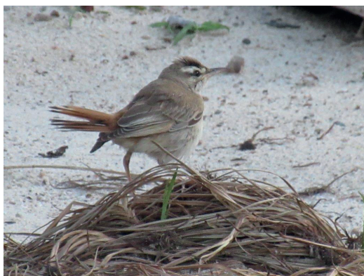
Figure 8. Rufous-tailed Scrub Robin / Agrobate roux Cercotrichas galactotes familiaris , Cousine, 7 November 2019 (Stuart Dunlop)