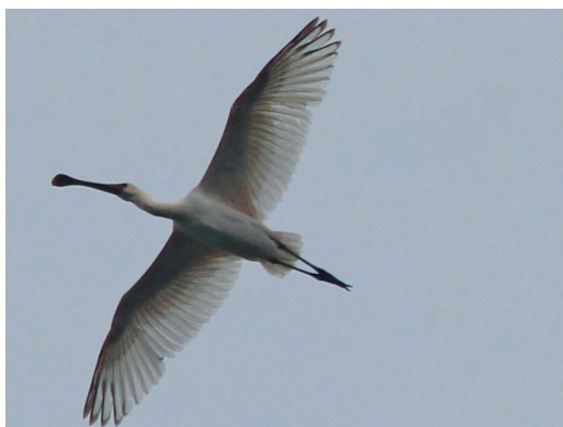
Figure 5. First-calendar-year Eurasian Spoonbill Platalea leucorodia , Aride, 30 December 2015 (Nicholas Pluchon) Spatule blanche Platalea leucorodia , 1ère année, Aride, 30 décembre 2015 (Nicholas Pluchon)

extraction and analysis: Claire Cécile Juhasz, FEDER SMAC).