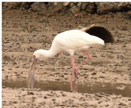
Figure 4. Adult African Spoonbill Platalea alba , Mahé, 14 November 2016 (Adrian Skerrett) Spatule d'Afrique Platalea alba , adulte, Mahé, 14 novembre 2016 (Adrian Skerrett)

Nine tracked with GLS technology between October 2017 and January 2020 entered the Seychelles EEZ between April and August. Four passed through the EEZ towards the northern Indian Ocean and five remained for part of their non-breeding season (observations kindly provided by UMR ENTROPIE, University of Réunion Island. These data are courtesy of a European Project: LIFE+ Petrels—Grant number LIFE 13 BIO/FR/000075. Data extraction and analysis: Audrey Jaeger).