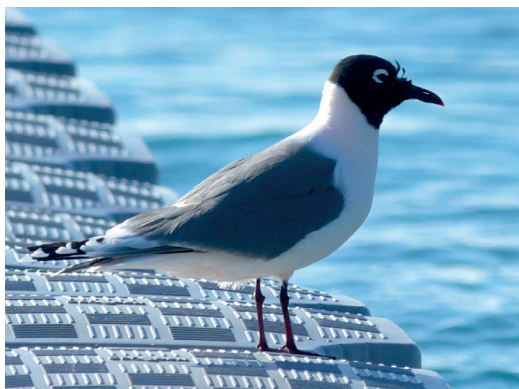
Figure 3. Adult breeding Franklin's Gull Leucophaeus pipixcan , D'Arros, 7 May 2017 (Clare Keating Daly) Mouette de Franklin Leucophaeus pipixcan , adulte en plumage nuptial, D'Arros, 7 mai 2017 (Clare Keating Daly)