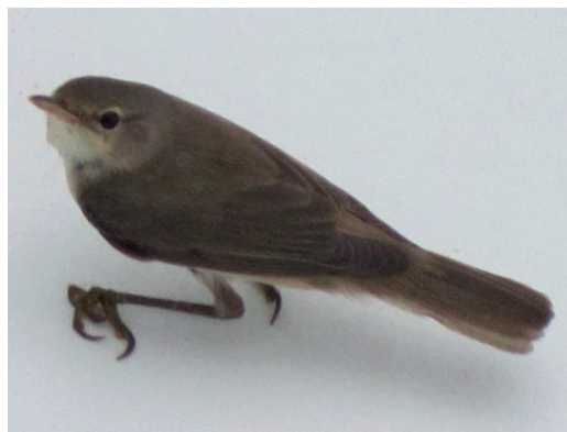
Figure 7. Eurasian Reed Warbler / Rousserolle effarvatte Acrocephalus scirpaceus fuscus , St François Atoll, 11 November 2015