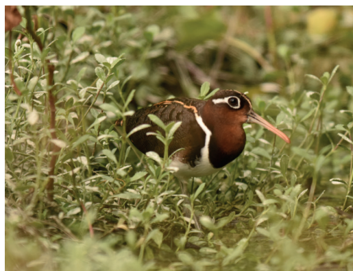
Figure 2. Female Greater Painted-snipe Rostratula benghalensis , Île Persévérance, Mahé, 30 January 2016 (Adrian Skerrett)

Rhynchée peinte Rostratula benghalensis , femelle, Île Persévérance, Mahé, 30 janvier 2016 (Adrian Skerrett)